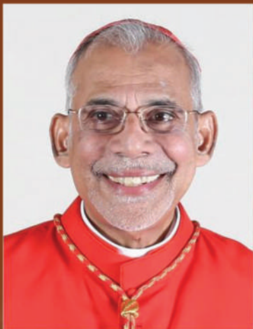
H. E. Cardinal Felipe Ferrão President, CCBI