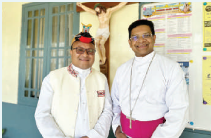
Catholic leaders of Shillong Archdiocese.